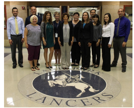
Lake Park's newest certified teachers were introduced during the Board of Education meeting. Welcome, Lancers!